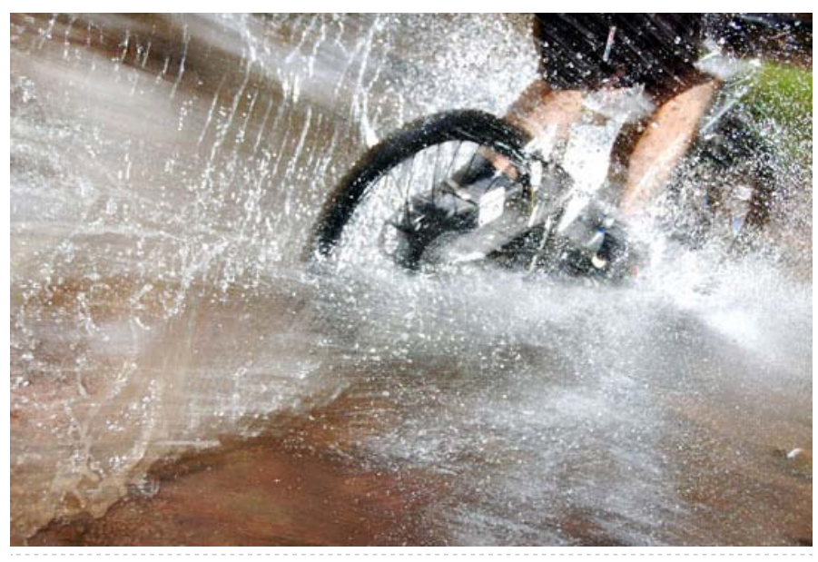
Rider challenging his skills by riding through a mountain stream, Quantocks, UK.

The people who designed the bike talk about what the bike can do, but the rider wants to find out what she can do. In the former vocabulary: "We give you 20 gears." In the latter vocabulary: "I've decided to bike to work twice a week, but I fear the pain of getting up that steep hill on the way there." If the bike company were smart, they'd be talking about making it easier to get up hills while commuting to work, or suggesting alternate routes or techniques so that you'll arrive at the office without needing a shower and a nap.